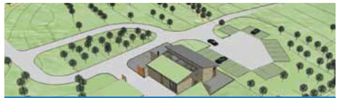
Walsall Burial Ground